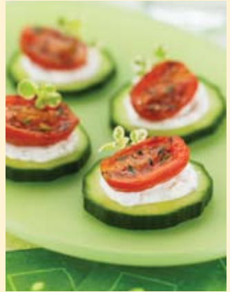
Cucumber and roasted tomato: For recipe go to www.becel.ca

Becel is a soft, tub margarine that is non-hydrogenated. It contains no trans fat.