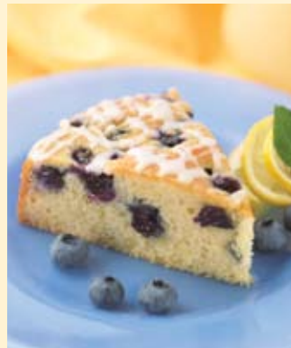
Lemon blueberry coffee cake: For recipe go to www.becel.ca

Some types of fat are important for health. Omega-3 polyunsaturated fat is a factor in the maintenance of good health. Because our bodies cannot produce omega-3 fats, we need to get this important nutrient from food. Becel is a source of omega-3 polyunsaturated fat.