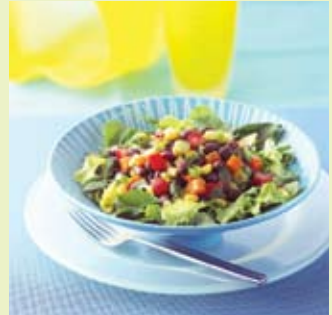
Bean salad: For recipe go to www.becel.ca

With so many types of Becel margarine available, it's easier than ever before to stick to your heart healthy habits in the kitchen, whether you're making a quick meal for yourself or entertaining guests.